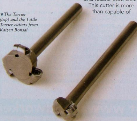
▼ The Terrier (top) and the Little Terrier cutters from Kaizen Bonsai

These Terrier cutters are excellent and happily tackle wood removal effortlessly and shaping with ease on a variety of timbers. They are adaptable to fit a range of power carving units, and should last you a good few years. ▶